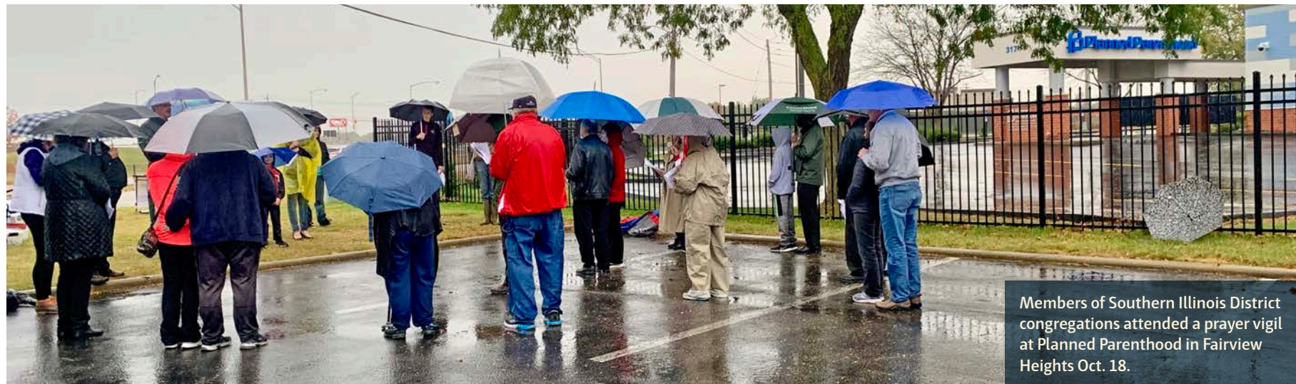
Members of Southern Illinois District congregations attended a prayer vigil at Planned Parenthood in Fairview Heights Oct. 18.